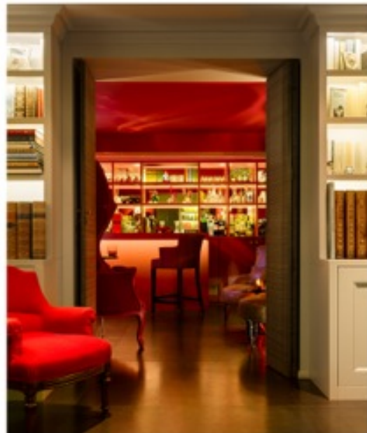
TOP: The basement in this family home has a host of hidden gems, including the stylish home cinema room featuring a vibrant velvet sofa and a gunmetal grey leather floor ABOVE: By removing white porcelain and replacing with high-glamour hammered basin, the bathroom is evocative of Middle Eastern luxury RIGHT: Upholstered fabric doors gives a Persian influence between rooms, whilst the rich colour palette draws the eye into a space that is warm and colourful